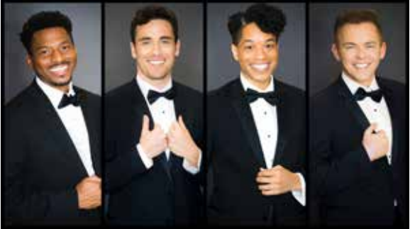
Sunday, January 21, 2024 2:30 pm

The Suits are comprised of four dynamic gentlemen performing four genres of hit music across four decades. The group fuses smooth choreography and tight harmonies with exciting showmanship and fun audience interaction, and take audiences on a journey from the 50s through the 80s. Their repertoire features recognizable hits like "Oh What A Night," "My Girl," Signed, Sealed, Delivered," and more!