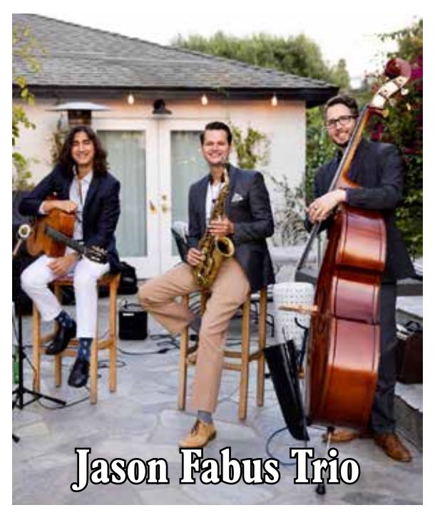
Sunday, April 7, 2024 2:30 pm

"...brilliant...radiant in new repertoire..." - Gramophone